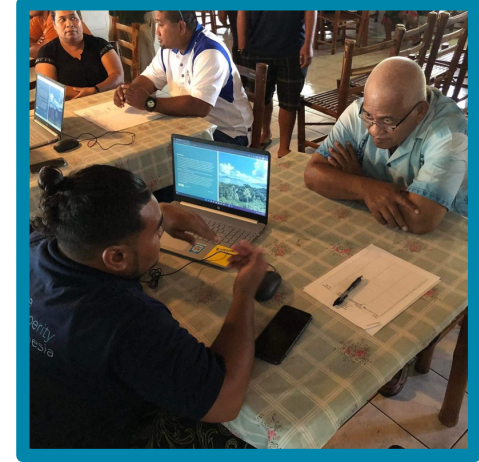
1,600+ Kosraens are represented in the Ocean Use Survey.

Kosrae partners shared survey results with state leaders, mayors, village council reps, resource management committee reps in early June. More than 1,600 individuals were represented in survey results. The results of the Ocean Use Survey provide insight into how Kosraens use and value the ocean, which will inform development of Kosrae’s Marine Spatial Plan. Great participation in the Ocean Use Survey in Kosrae will help ensure that the planning for the future of Kosrae’s ocean is inclusive and representative of many citizens, across municipalities and sectors of interest. Ocean Use Surveys will be replicated in the other states as well.